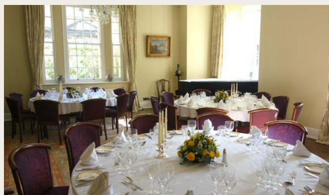
Rector's Drawing room