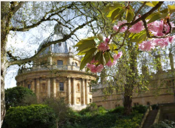
View from the Fellows' Garden