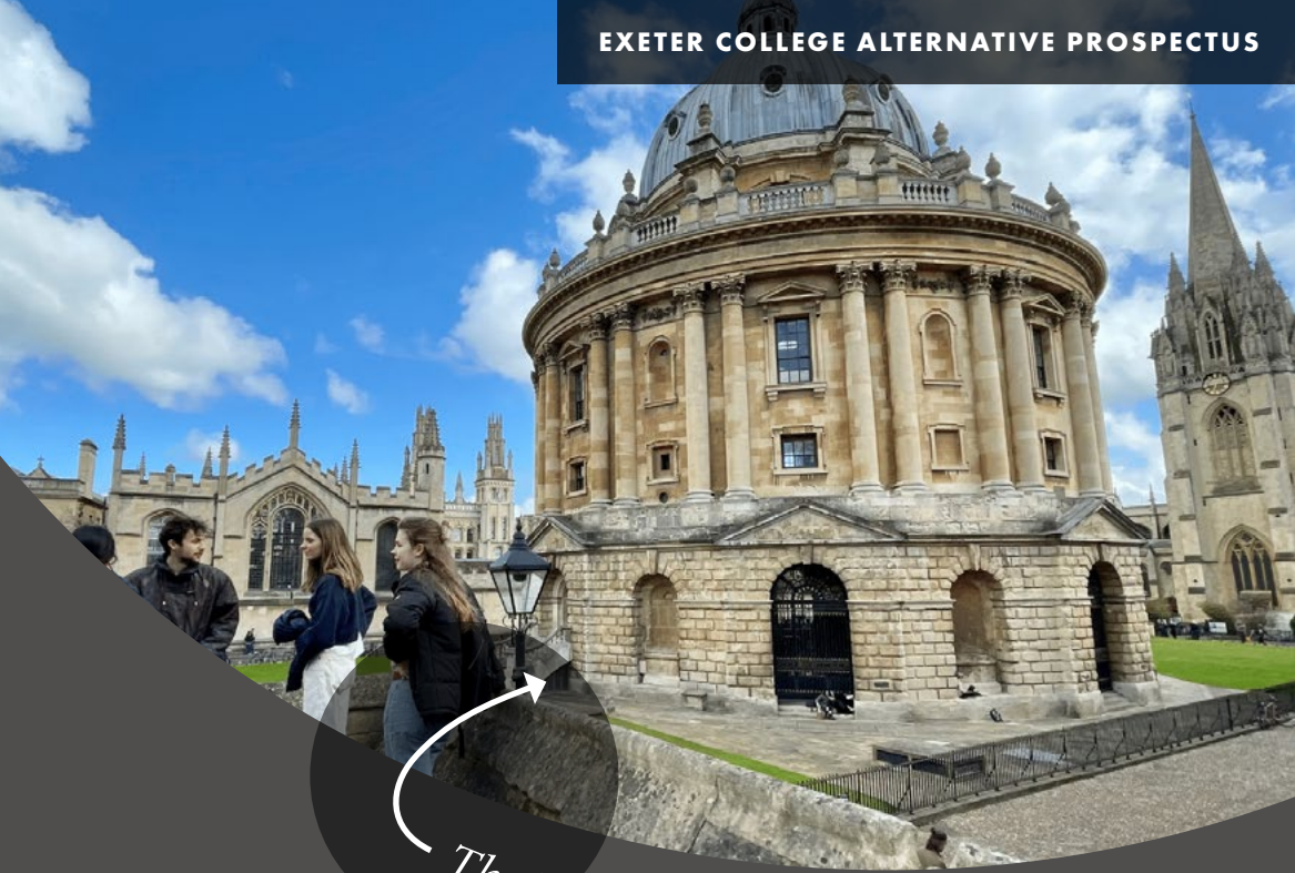
The best view in Oxford

This is also home to our beautiful chapel, the JCR (Junior Common Room), our hall (used for both formal dinners and normal meals) and our library, found in the Fellows' Garden. In our opinion, the Fellows' Garden (which is open to students) offers the best views in the whole of Oxford. Older years tend to live in a variety of locations, from the main site to College-owned Friendship houses to Exeter House on the Iffley Road and Cohen Quadrangle. Opened in 2017, Cohen Quad is Exeter's most modern site and comprises three floors of rooms, as well as study and social spaces and the Dakota Café. No matter your requirements or preferences, Exeter has something for everyone and accommodation is allotted each year by a ballot to ensure as fair a process as possible.